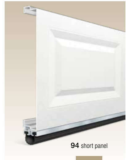
94 short panel