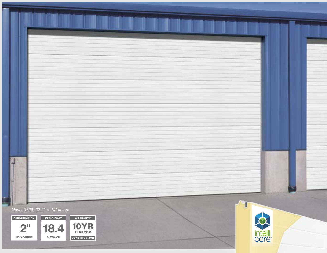
Model 3720, 22'2" x 14' doors