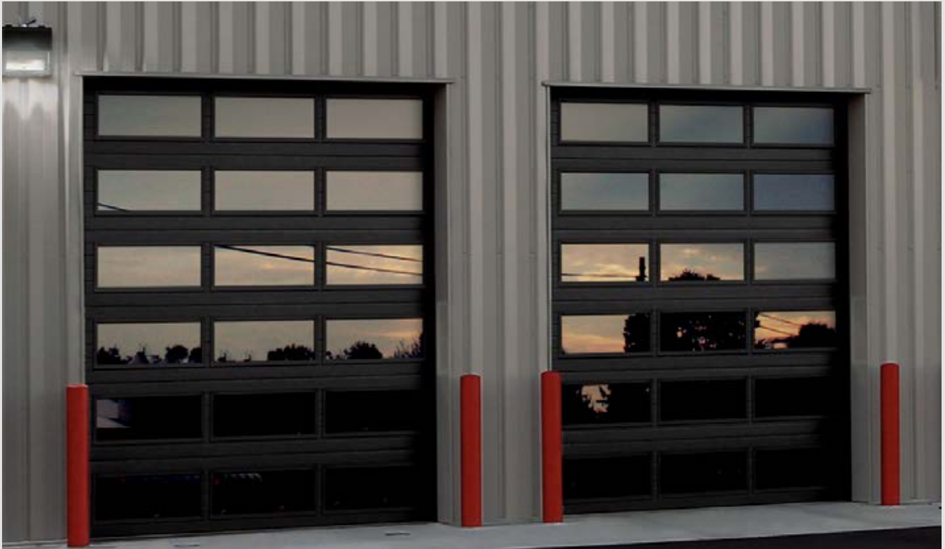
Model 3729, 12'2" x 12' doors, shown with 42" x 16" lites